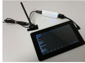
Figure 1: The DTV dongle with external antenna interfaced with the Android tablet.

The Open Source Mobile Communications (Osmocom) [1] has a community-supported project developing software sup-